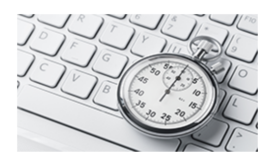
2021 Symantec Intelligence Services and WebFilter Category and Application Update

On October 12, 2021, category enhancements will be delivered to Intelligence Services (formerly Blue Coat Intelligence Services or "BCIS") and WebFilter (formerly Blue Coat WebFilter or "BCWF") URL Categories and Application Classifications.